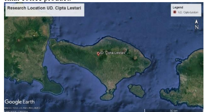
Figure 1. Research Location of UD Cipta Lestari, Pujungan Village, Pupuan District, Tabanan Regency, Bali

The research was conducted at UD. Cipta Lestari, Pujungan Village, Pupuan District, Tabanan Regency, Bali (Figure 1). The study was carried out over a period of 1 month, covering the process from the input of materials to the final coffee product.